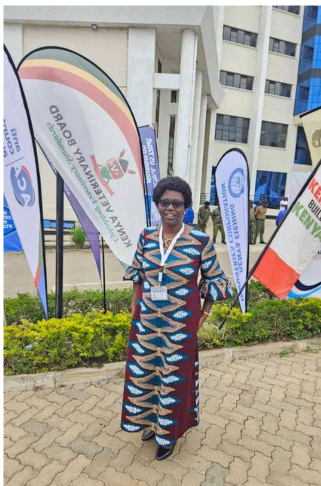
KVB CEO during the 2025 Madaraka Celebrations in Homabay County.