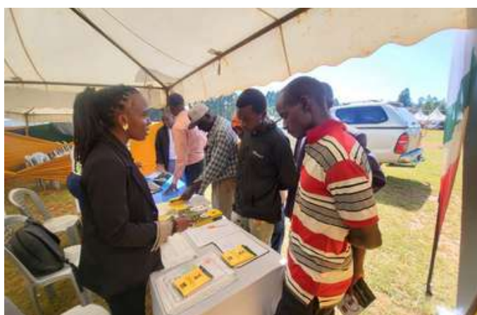
A veterinary inspector advising farmers on the mandate of the Board.

The team then proceeded for post inspection surveillance in Nyamira and Kisii Counties. The assessment revealed various cases of malpractice with non registered individuals were dispensing veterinary medicine.