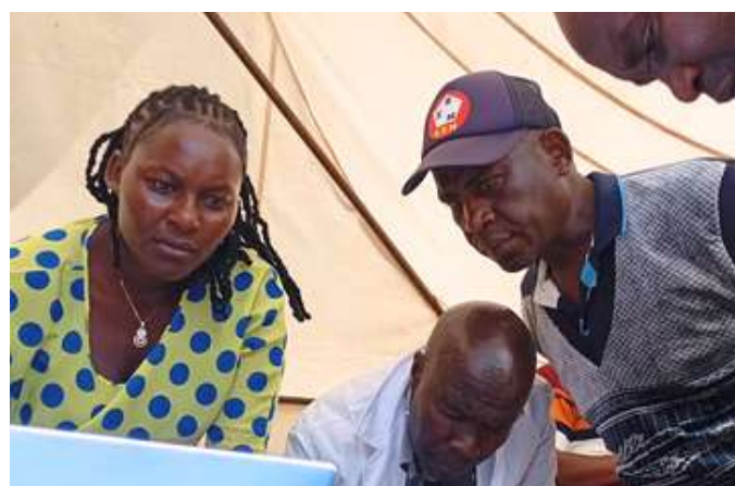
Veterinary professionals confirming their retention status with a veterinary inspector.