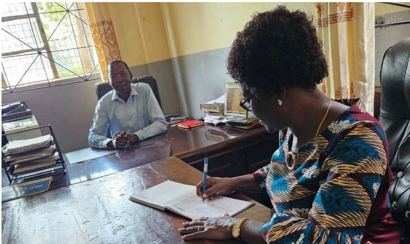
KVB CEO paying a courtesy call to CDVS, Homabay County.