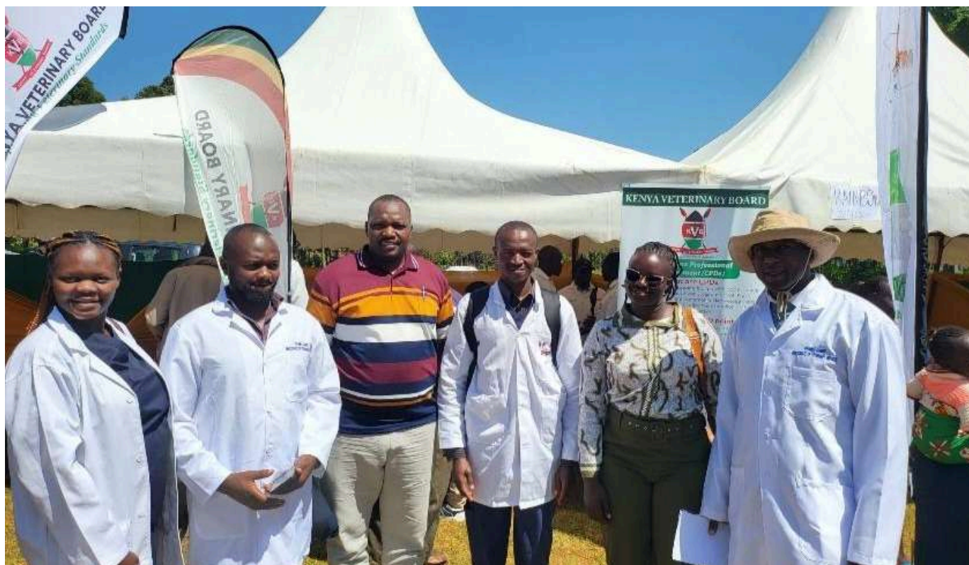
KVB's Director, Compliance & Market Surveillance during a field day in Kisii County.