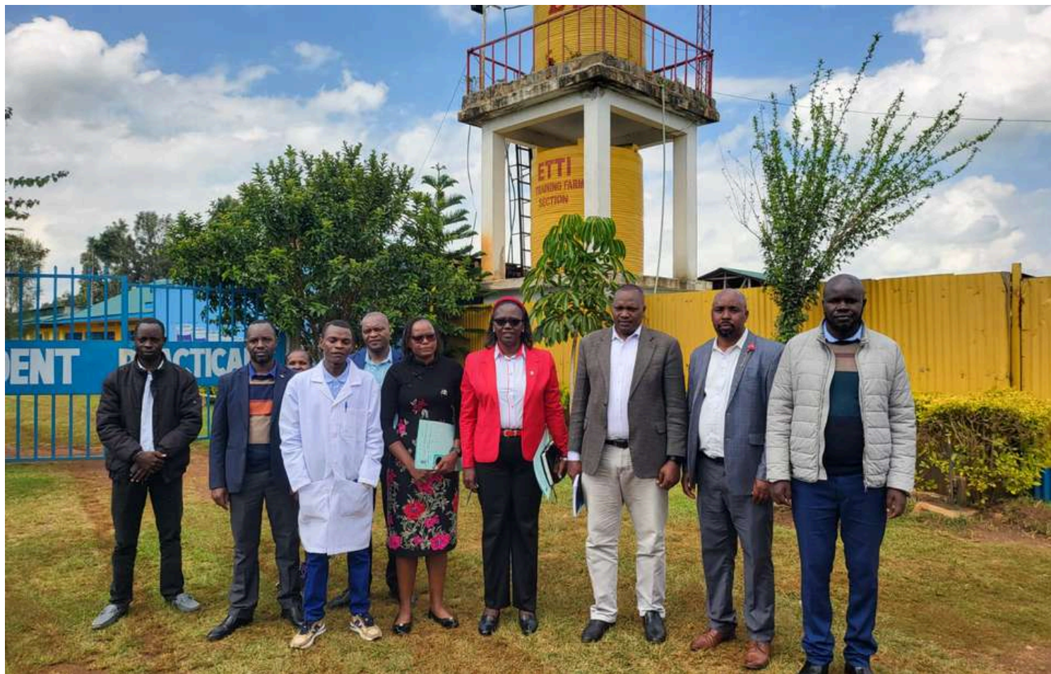
KVB Team during inspection of Eldoret Technical Training Institute.