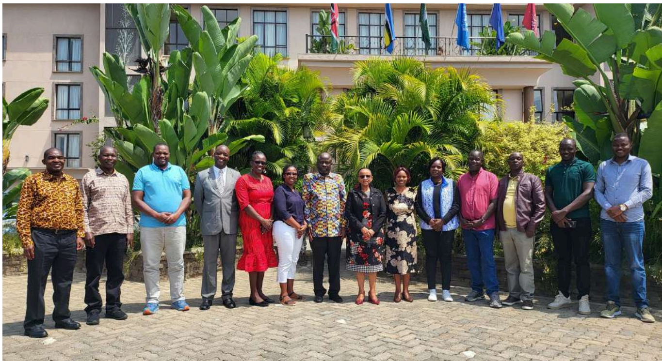
Stakeholder meeting between KVB, VMD Council & other stakeholders to review the Veterinary Practice & Medicinal Products Bill, 2024.